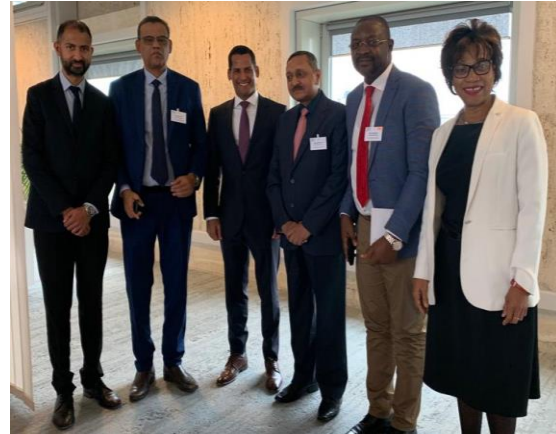
DG, NADA representing India at the 7th Conference of Parties to the International Convention, Paris, 29-31 October