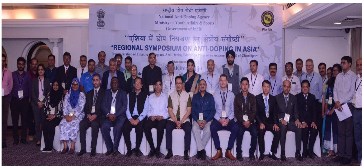
Group photo of international delegates with Hon'ble Minister, Youth Affairs and Sports