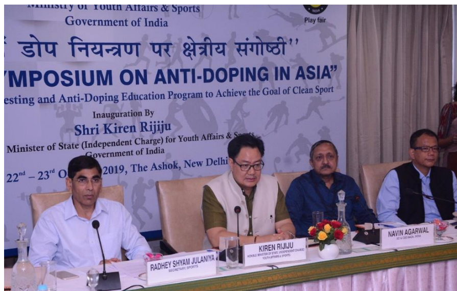
Inauguration of Regional Symposium on Anti Doping in Asia by Sh. Kiren Rijiju, Hon'ble Minister, Youth Affairs and Sports

Two day symposium on anti doping in Asia was organized by NADA, India from 22-23 October, 2019 at New Delhi. The symposium emphasized on implementation of effective testing and anti-doping education program to achieve the goal of clean sport. Delegates from Australia, Malaysia, Cambodia, Myanmar, Bangladesh, Nepal, Maldives, Qatar and Jordan appreciated the conduct of the symposium by NADA India.