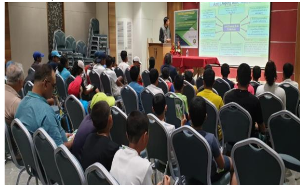
Regional Coordinator, NADA South and West Region conducting anti doping awareness session for football players at Bellary and at ITF Tennis event, Pune