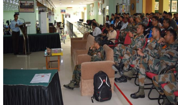
Anti-doping awareness session at SAI STC, Kurukshetra and Indore