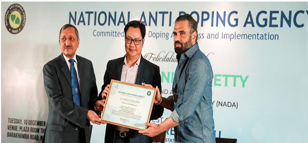
Hon'ble Minister, Sh. Kiren Rijiju, and DG & CEO, NADA during felicitation ceremony of Mr. Suniel Shetty

Bollywood actor Mr Suniel Shetty was named the brand ambassador of the National Anti Doping Agency (NADA) in a move to encourage the athletes to stay away from banned performance enhancing substances. The Hon'ble Minister for Youth Affairs and Sports Shri Kiren Rijiju, who was the chief guest at the Ceremony, called for a rigorous campaign to bring awareness about doping. The Minister also complimented Shri Suniel Shetty for being appointed as the brand ambassador of NADA. He said, "Shetty is a fitness icon and his services for this cause will inspire everybody to stay healthy, fit and adopt fair means in sports.