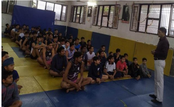
Training for newly empaneled Doping Control Officers at Guwahati

In the month of October, November and December 2019, anti-doping awareness cum education workshops/ seminars were conducted by NADA at West Godavari, Dibrugarh, Guwahati, Jalpaiguri, Agra, Bodhgaya, New Delhi, Indore, Jabalpur, Kurukshetra, Bangalore, Bellary, Pune, Navi Mumbai, Chennai, Sonipat and Bhubaneshwar.