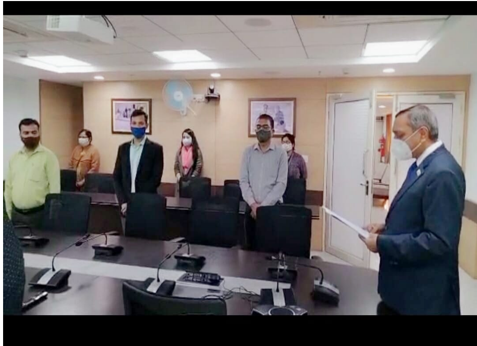
Sh. Navin Agarwal, DG & CEO, NADA reading preamble of Constitution of India alongwith NADA officials

DG, NADA, Shri Navin Agarwal read out the Preamble of the Constitution of India on 26 November at 11.15 am, and all officials of the National Anti-Doping Agency took the pledge to abide by its values in letter and spirit.